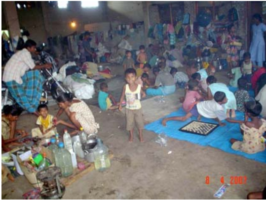
over-crowded refugee camp