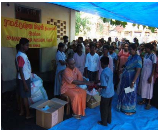
Children receiving new clothes

1500 patients have already been seen in the refugee camps and more clinics are planned to cover other camps in the future. The Mission needs Rs. 36 Million (US$ 330,000) for 3 months for relief work. WE HAVE RAISED $6,000 TOWARDS THE COST OF SUCH A MOBILE VAN CLINIC