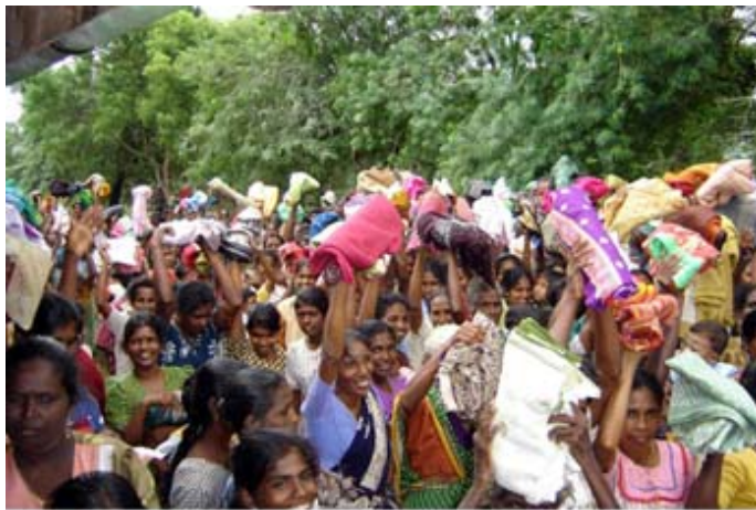
Tsunami relief work; more than Rs. 17 million worth of materials were distributed

The Ramakrishna Mission was incorporated by Act No. 8 1929 and has its headquarters in Colombo. In keeping with its ideals, the Centre is engaged in various spiritual and humanitarian activities.