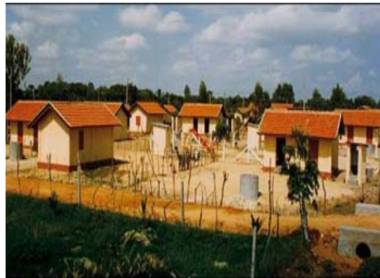
Two hundred permanent houses for Tsunami Victims

Due to a new eruption of violence in the eastern part of Sri Lanka , 72,000 people have been displaced from Vaharai, Sampoor and Muthur. Among the displaced 17700 are children of whom 10,500 are school-aged. 41,500 (1160 families) people are in 61 refugee camps.