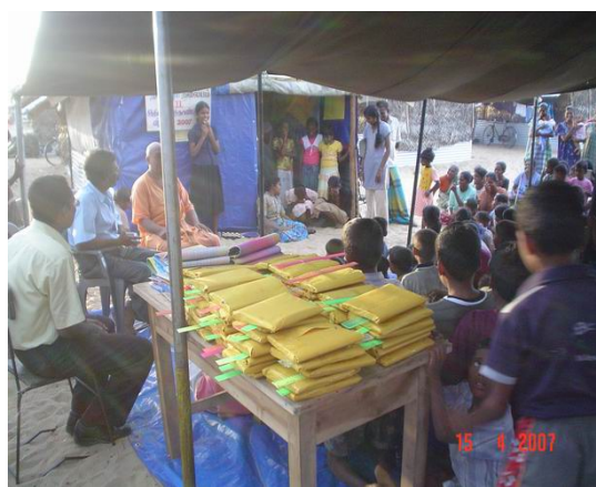
eagerly awaiting new school stationery (remember how exciting that was??)

“FOR EVERY $1 SPENT ON A CHILD, THE WHOLE COMMUNITY BENEFITS SEVEN-FOLD” (Unicef)