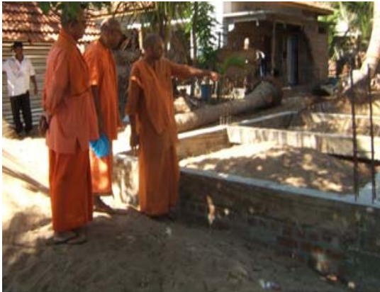
Swamis discuss the progress of 200-permanent housing project for tsunami victims