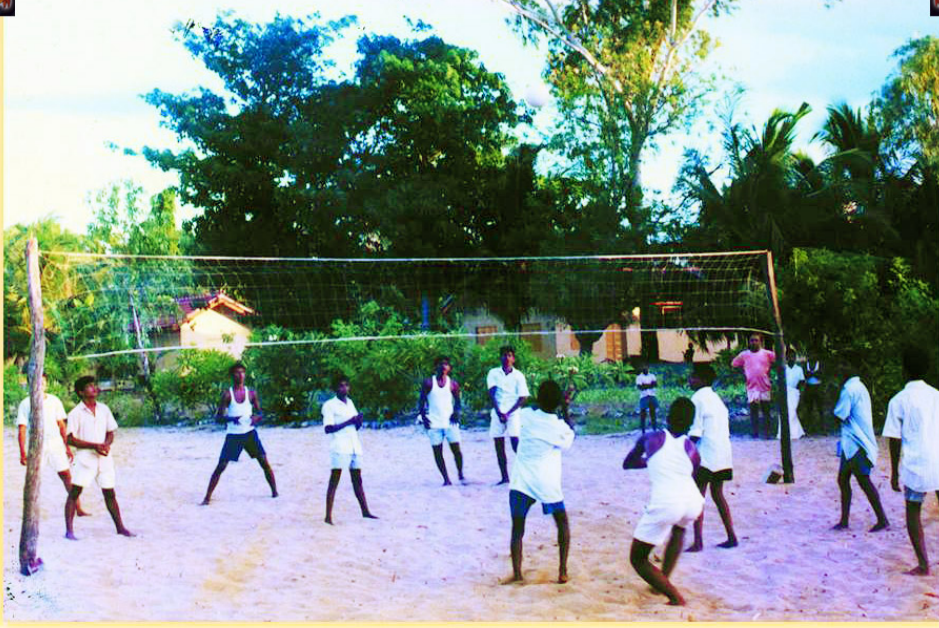
மாலையில் விளையாட்டுப் பயிற்சி