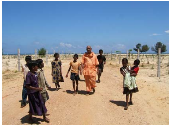
children are cared for by swamis

The Divisional Secretary, Manmunai North, requested Ramakrishna Mission to provide food and medical facilities to the displaced people in Manmunai area. Relief Work was started on 25th Decemeber 2006, with 6 refugee camps taken up since 5th January 2007. Breakfast, lunch and dinner are provided for 3855 people with an estimated cost per day of about Rs.400,000/- (Approx US$ 4000 – or approx $US 1 per head per day). Ramakhrisna Mission currently expends $110,000 a month helping these people