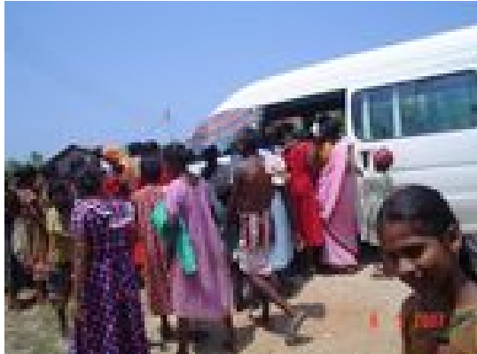
a mobile van clinic

1500 patients have already been seen in the refugee camps and more clinics are planned to cover other camps in the future. The Mission needs Rs. 36 Million (US$ 330,000) for 3 months for relief work. WE HAVE RAISED $6,000 TOWARDS THE COST OF SUCH A MOBILE VAN CLINIC